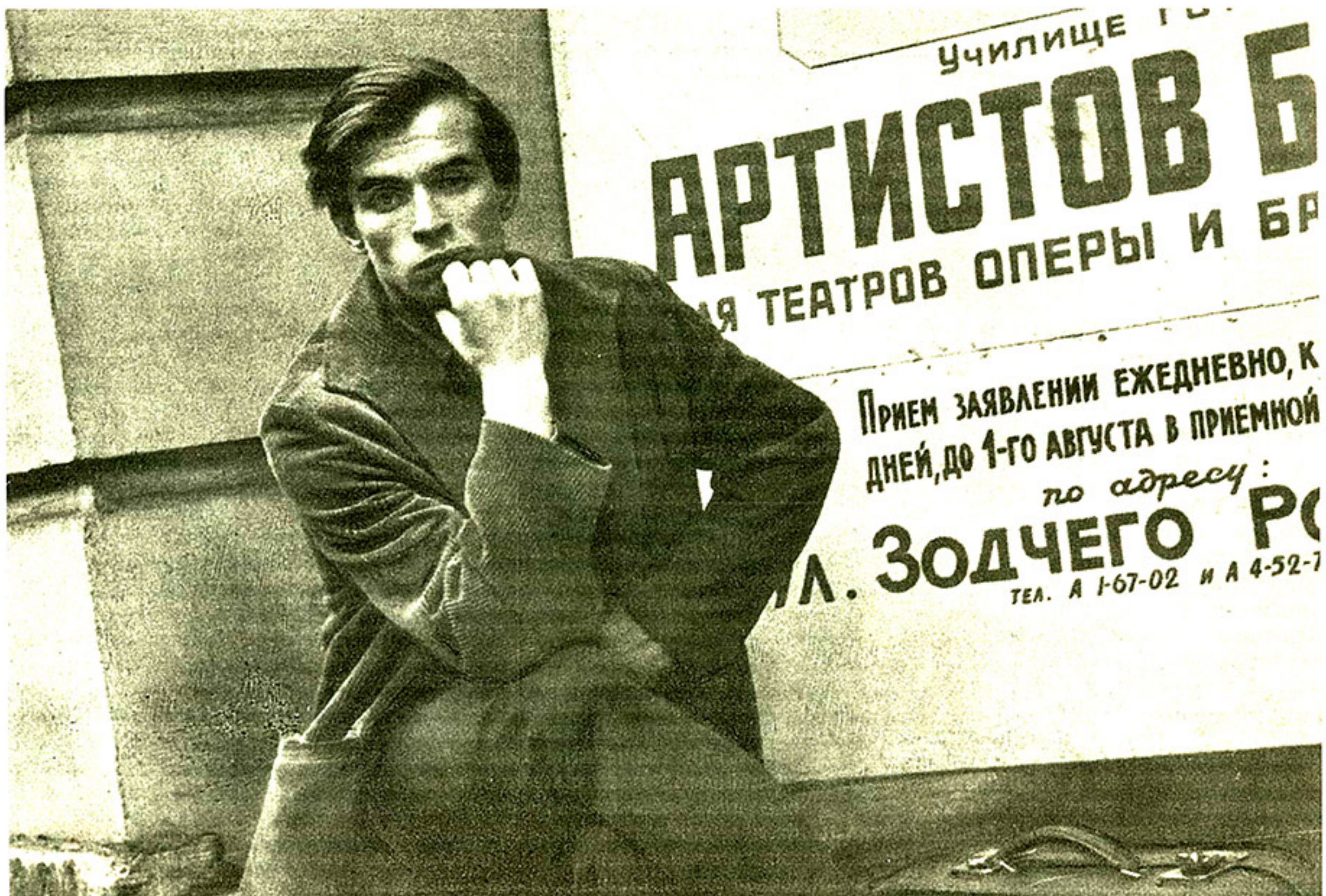
Rudolf Nureyev near the Vaganova Academy in Leningrad, circa 1960, and, opposite, at the Palais des Sports in Paris, 1974.